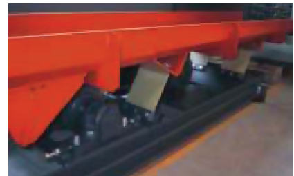
Vibrating conveyor system with integrated drive train