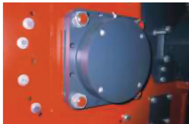
High quality sealed bearings