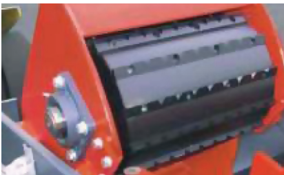
Pinch feed system with replaceable strips